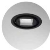
Poco System EFT