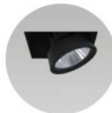
Poco Downlighter LED